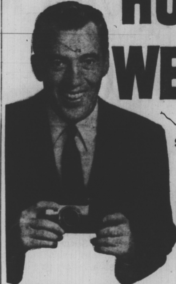
Says TV's Ed Sullivan