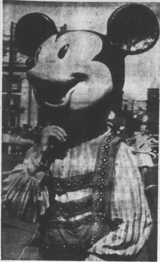
OUT OF STORYBOOK LAND