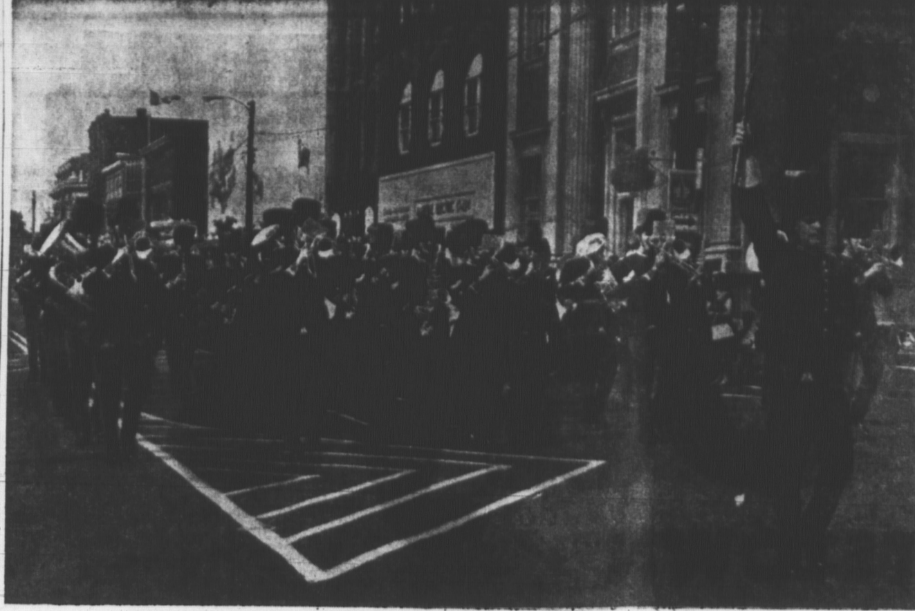
CANADIAN ARTILLERY BAND NO STRANGER TO P. E. I.