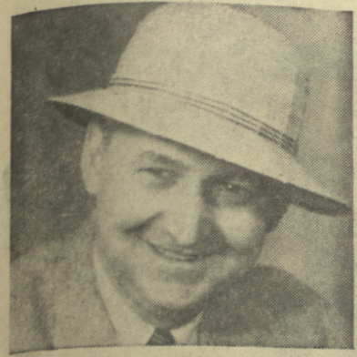
The White Hunter