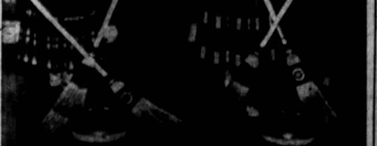
TED KENNEDY ally: Moore 8:10. Second period: 2. Montreal, M. Richard (Moore, Harvey) 10:04. 3. Toronto, Armstrong (Kennedy Smith) 15:04. Penalties: Baun 5:4, Marshall 13:20, H. Richard two minors 16:35, Migay two minors 16:35. Third period: 4. Toronto, Kennedy (Smith, Reaume) 18:38. Penalties: H. Richard 8:38, Baun 8:38.

SUMMARY First period: 1. Toronto, Kennedy (Smith, Reaume) 13:15. Penalties: Moore 8:10. Second period: 2. Montreal, M. Richard (Moore, Harvey) 10:04. 3. Toronto, Armstrong (Kennedy Smith) 15:04. Penalties: Baun 5:4, Marshall 13:20, H. Richard two minors 16:35, Migay two minors 16:35. Third period: 4. Toronto, Kennedy (Smith, Reaume) 18:38. Penalties: H. Richard 8:38, Baun 8:38.