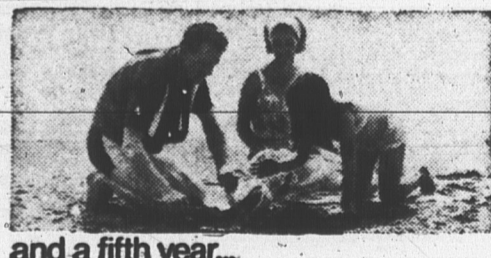
and a fifth year...