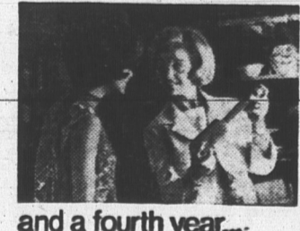
and a fourth year...