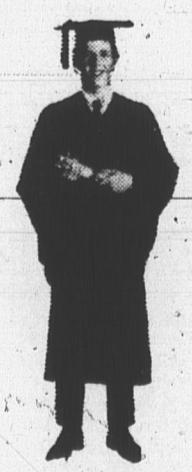
and a sixth year?