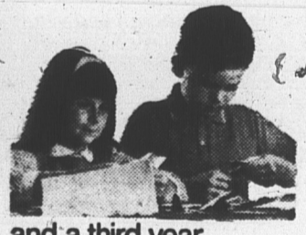
and a third year...