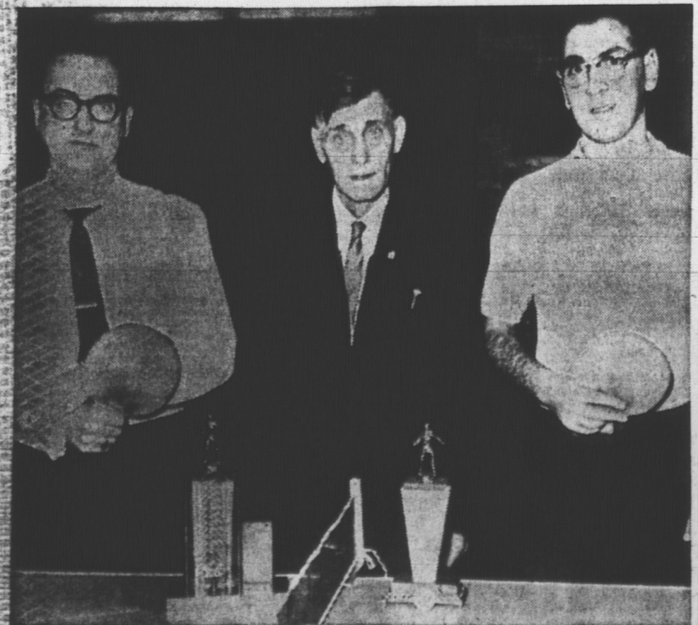
LEGION TOURNAMENT BEGINS

One man was fined $20 and costs on each of two charges of illegal possession of liquor.