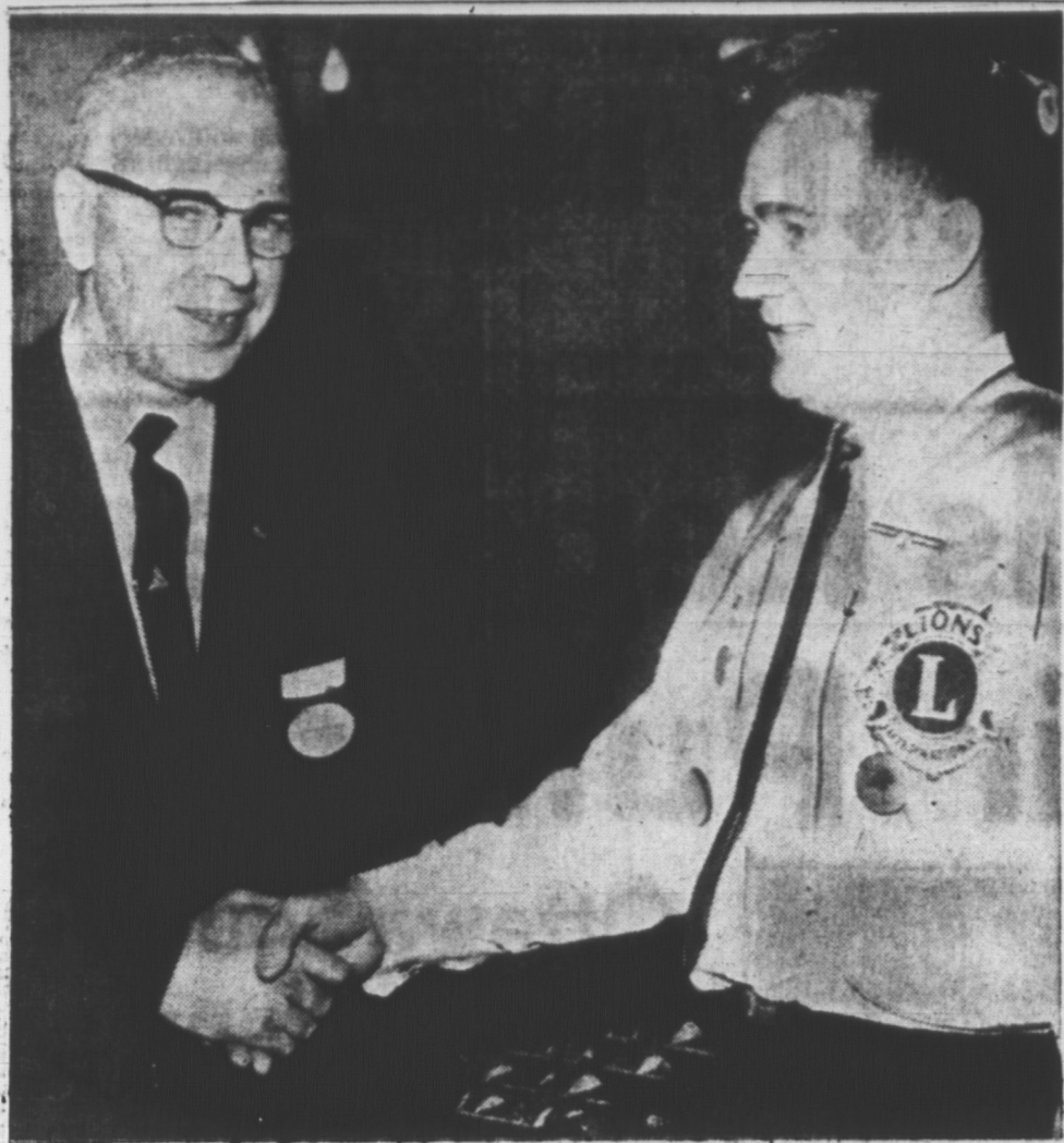
DISTRICT GOVERNOR VISITS CLUB