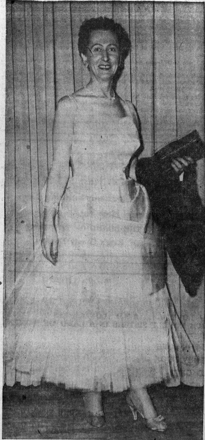
A CHARMING MODEL