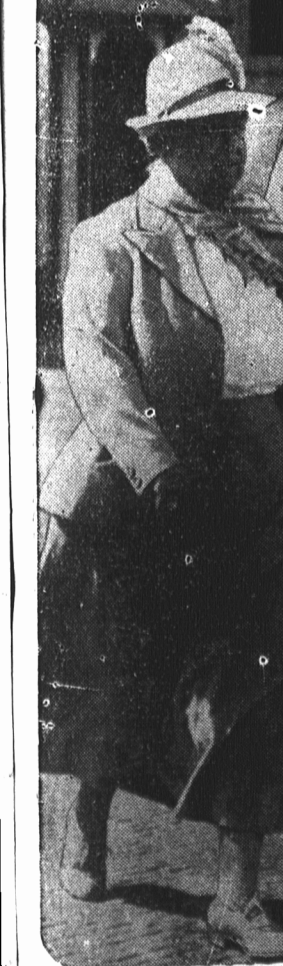
Shortly after the conflict between Poland and Germany began, Queen Wilhelmina appeared before her people at The Hague. This photograph shows the Queen with Prince Bernhard and Princess Juliana. On the arm of the Prince is little Princess Beatrix, the royal couple's first child, their second daughter Princess Irene being only six weeks old.

—WOOL FROM UNITED KINGDOM OTTAWA, Sept. 20.—(CP)—The War Time Prices and Trade Board announced today 750,000 pounds of wool, clean basis, would be released for export from the United Kingdom to Canada. The wool is required in Canada for the manufacture of cloth for uniforms and other military purposes.