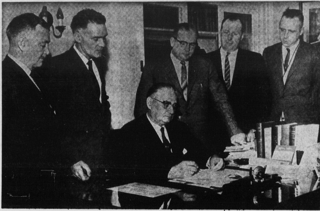
FRASER VALLEY LTD. OFFICIAL SIGNS AGREEMENT WITH GOVERNMENT

The purchase of new fire equipment which included a new fire engine costing approximately $14,000 has given the town adequate fire protection. A full time town policeman as well as a detachment of RCMP is available at all times for the protection of citizens and property.