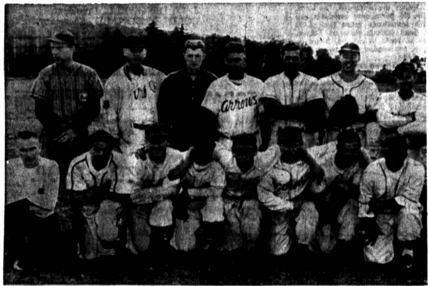
INTERMEDIATE "B" RUNNERS - UP

Photographed above are the members of the Peakes baseball team which captured the Island Intermediate B title at Peakes