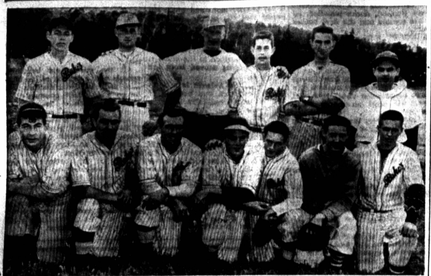
ISLAND INTERMEDIATE "B" WINNERS

PITTSBURGH (AP) — Frank Thomas knocked in three runs with a homer and three singles Monday night to lead the Pittsburgh Pirates to a thrilling 6-5 victory over the Brooklyn Dodgers.