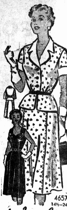
4657 14 1/2-24 1/2 by Anne Adams

Pattern 4657: Half Sizes 14 1/2, 16 1/2, 18 1/2, 20 1/2, 22 1/2, 24 1/2. Size 16 1/2 dress and jacket 4 1/2 yards 38-inch fabric; 1/2 yard contrast. This pattern easy to use, simple to sew, is tested for fit. Has complete illustrated instructions. Send THIRTY-FIVE CENTS (35c) in coins (stamps cannot be accepted) for this pattern. Print plainly NAME, ADDRESS, STYLE NUMBER. Send order to ANNE ADAMS, c/o The Guardian, 60 Front Street West, Toronto.