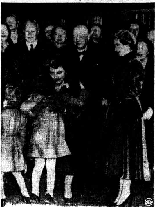
Princess Margaret (right) watches as her mother, the Queen Mother Elizabeth, hugs Prince Charles in a farewell at the railroad station in London, from where the Queen Mother travelled on a boat train to Southampton. Princess Anne is shown at left. Standing are Prime Minister Sir Winston Churchill (right) and U. S. Ambassador to England Winthrop W. Aldrich. The Queen Mother is on her way to America for a visit.