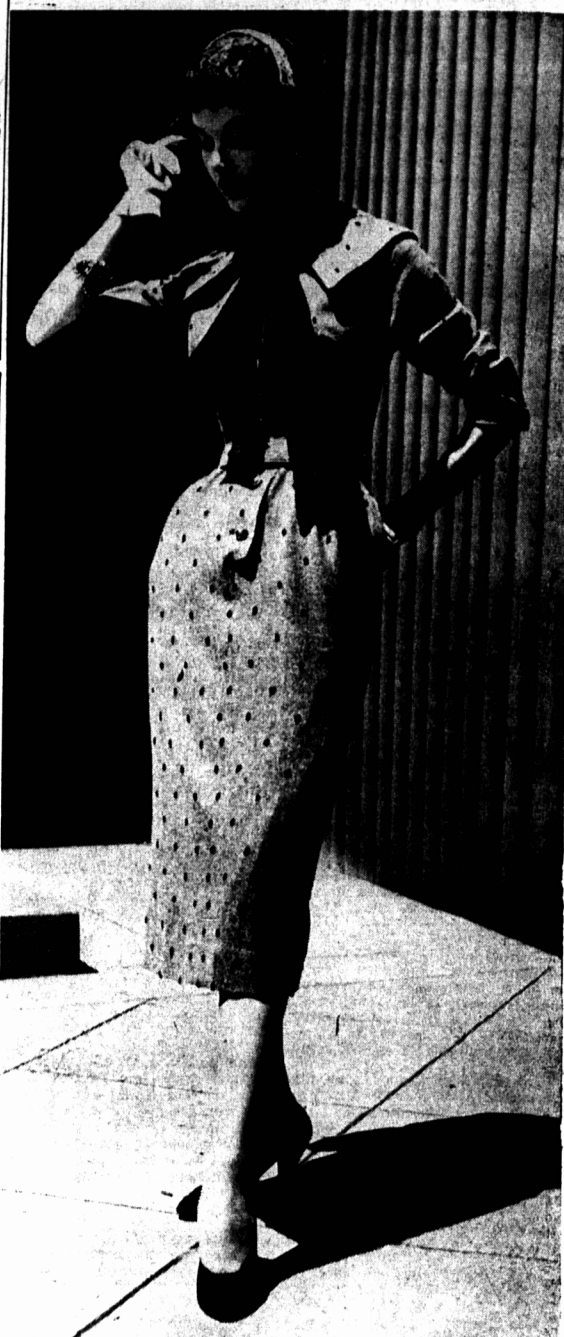
This Puritan dress in Rembrandt grey wool with all-over black wool tufts has been designed especially for the Canadian business girl. The large collar is tied with a detachable organza bow. A buttoned placket that ends at the hipline is tightened at the waist by a curved self-fabric belt and the slim skirt has a kick pleat for walking ease. Day-wear accessories are a tiny feather cap and very short gloves.