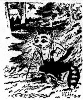
He was keeping out of sight under some young evergreen trees.

ENOUGH IS ENOUGH More than enough has no excuse. Enough is all that's to use. —Old Mother Nature. Bobby Coon was licking his sores. They smarted. They had been made by the claws of Mrs. Hooty, the big Owl whose nest he had climbed to without knowing until he reached it that anyone was using it. You see, it was still the end of winter, and it hadn't entered Bobby's head that any of the feathered folk had begun nesting at this time. Mrs. Hooty's great curved claws, with points as sharp as needles, had dug in deep and torn his coat. Then, too, he had