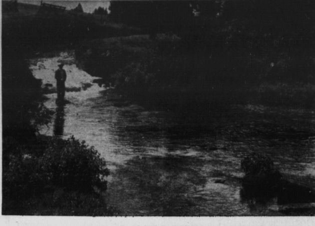
LONE ANGLER TRIES HIS LUCK IN ONE OF HUNDREDS OF ACCESSIBLE STREAMS

Besides having excellent shopping facilities there are a dozen churches. Island towns are noted for their well-kept flower gardens and the tall trees that line the streets. MORE WATER The ocean takes up 140,000 square miles of the earth's surface compared to land's 57,000,000.