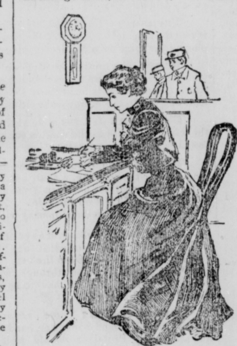
The signature was that of Grimwood's agent in Chicago.

"I'll break old Grimwood's neck for him yet," growled Howard, still harping on the interruption, "in a Stock Exchange sense, of course," he added.