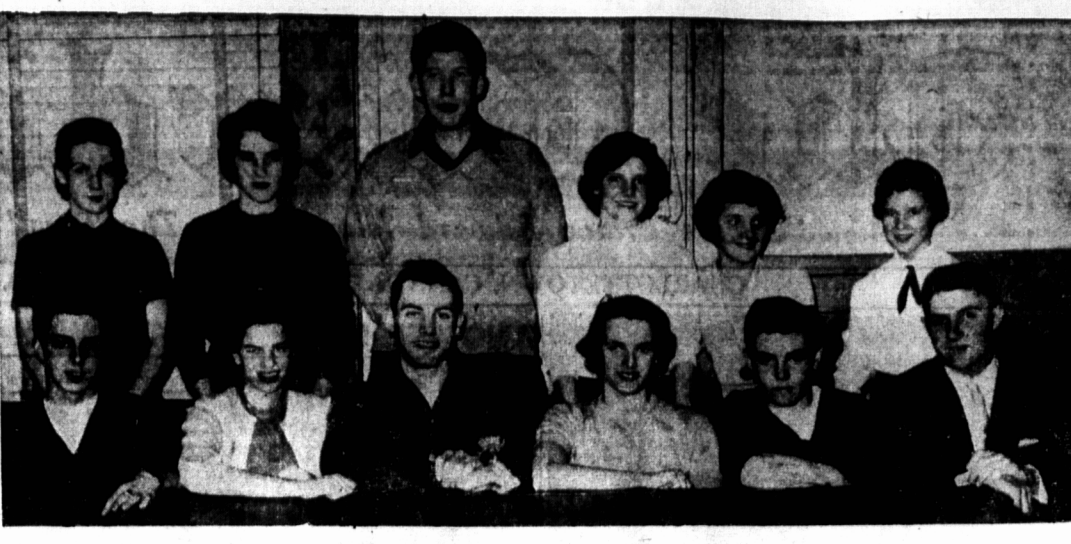
ONE HUNDRED and forty young people were inducted in the Hi-Y Clubs of the Y.M.C.A. in

Repairing light fixtures, motor rewinding and repairs, washing machine repairs. We sell and service electrical appliances. Free pick up and delivery.