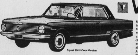
Signet 2-Door Hardtop

Go get a tiger... Plymouth '64! The clean-lined beauty with real "tiger-power"! Pick your power from three great engines — Slant Six, Fury V-900, or mighty Golden Commando V-8. Team it with Torque-Flite Automatic drive with Push Button or console floor shift, or Fury "four-on-the-floor" stick shift. Then sit back in Plymouth's sport-slanted comfort—turn the key—and tame a tiger!