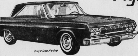
Fury 2-Door Hardtop