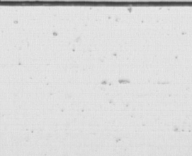
Now in full King Size, too