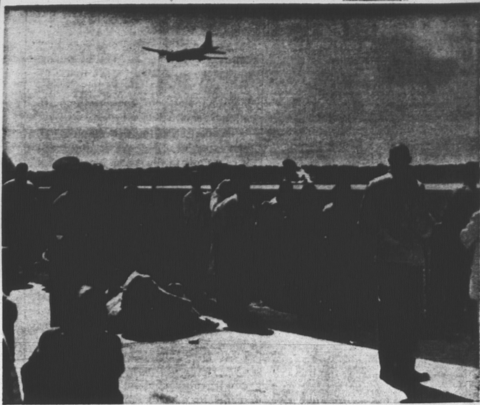
ARGUS BOMBS SUBMARINE BEFORE LARGE CROWD

The Lutheran Church of America is sending 140 Americans and one French youth to work in missions and relief agencies this summer.