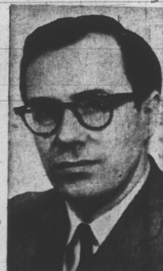
Mark MacGuigan Queens