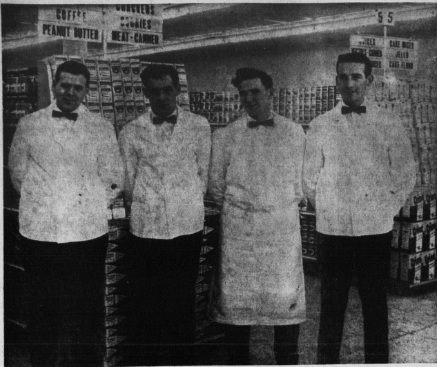
SHOPPING CENTRE'S DEPARTMENT MANAGERS HAVE EXPERIENCE AND KNOWLEDGE