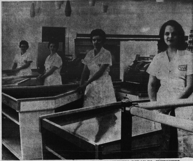
FOUR CHECKOUT COUNTERS WILL RESULT IN MINIMUM DELAY TO CUSTOMERS