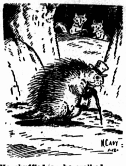
He shuffled as he walked.

"I hope that's it," said Soft-Eyes. So the two young foxes took