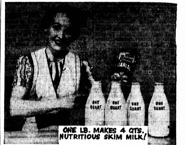
ONE LB. MAKES 4 QTS. NUTRITIOUS SKIM MILK!

Although lightning seldom strikes balloons, three entries in the Gordon Bennett balloon race of 1923 were struck, and fell to the earth in flames.