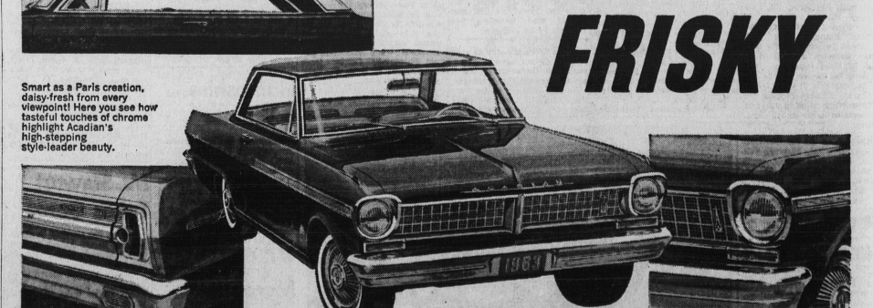
Baumont Sport Deluxe Sport Coupe Whitwell tires optional at extra cost

Got a well-developed taste for things original... and beautiful Acadian's ultra-smart instrument panel design will have you applauding. The plan? To have everything in easy reach and positioned 'just-so' for easy viewing. See how well we've succeeded!