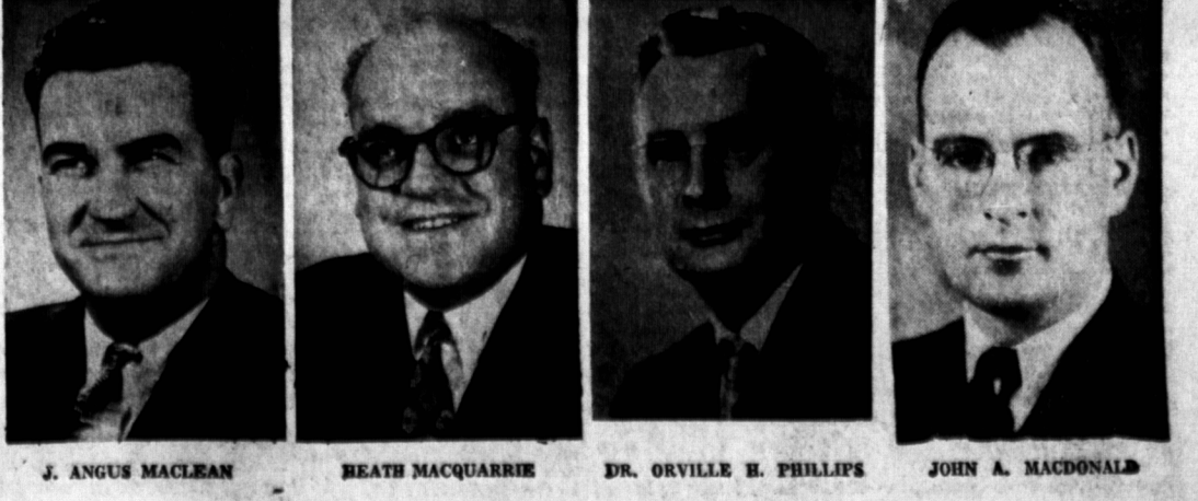
J. ANGUS MACLEAN HEATH MACQUARRIE DR. ORVILLE H. PHILLIPS JOHN A. MACDONALD