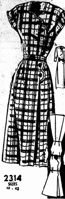
2314 SIZES 12-42

top of the layers. Maple nut frosting—6 tablespoons butter, 3 cups cups confectioners sugar, 5 tablespoons cream—salt, 3/4 teaspoons maple flavoring, 2/3 cup chopped walnut meats; cream butter, sift sugar gradually, add creaming constantly, add enough cream to make mixture right for spreading, add salt and flavoring, mix well, spread between layers, sprinkling with nut meats. Make enough to fill and frost 2 1/2-inch layers.