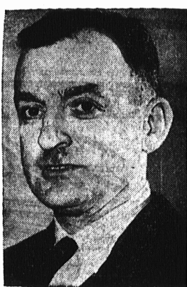
Hon. James Sinclair

OTTAWA, Oct. 15—(CP)—Hon. Robert Mayhew, 72-year-old minister of fisheries, was appointed today as Canada's first ambassador to Japan and two British Columbia Liberal members were named to the cabinet.