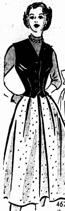
4672 10-20 by Anne Adams

1. What is a word beginning with ve that means "acting with great force; ardent"?