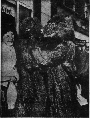
THOSE LOVABLE BEARS