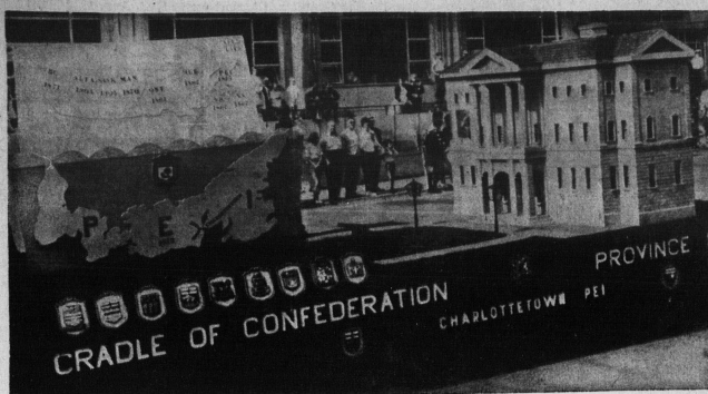
CH'TOWN FLOAT WON GREAT ACCLAM