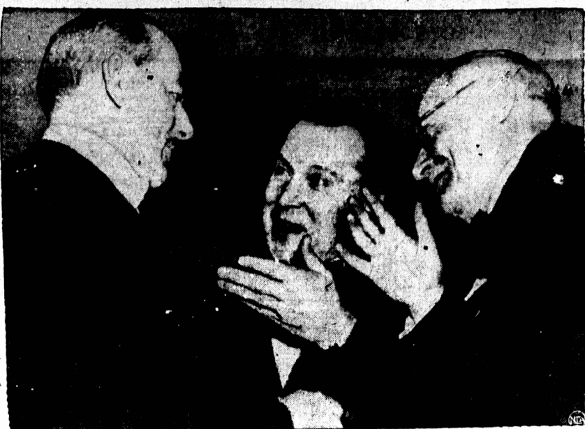
U.S. Secretary of State Dean Acheson (left) and Russian Foreign Minister Andrei Vishinsky (right) are seen on the receiving end of a diplomat. They were guests at the Presidential dinner for U.N. delegates in Paris.

It was also decided to schedule a dance and party for members at the new "Green Room" on the 9th.