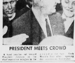
PRESIDENT MEETS CROWD A hand reaches out toward President Johnson as he opens chief executive mingles in the crowd at the New York World Fair after opening day ceremonies Wednesday.

WORK MOUNTED SYDNEY, Australia (AP)—Sydney's 2,700 mail sorters had to tackle an accumulation of 14,000 letters and packages recently when they ended a week-long strike called to protest increased night work schedules.