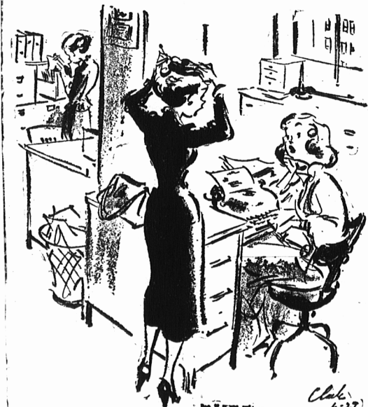
"The boss gave me the rest of the day off. If this headache had come on sooner, I could get shopping done."