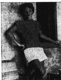
A striped casual sweater knitted from crocheted wool is wonderful for summer sports wear. It can be worn with shorts, slacks or teamed with your very best skirt. The one pictured here is knitted lengthwise to avoid joining wools when changing colours. If you would like to have a direction leaflet for making the TRI COLOURED CASUAL in sizes 32, 34 and 36 inches, just send a stamped, self-addressed envelope to the Needlework Department of this paper and ask for Leaflet No. CW-37.