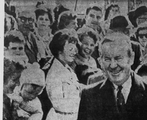
TOURISTS ON Parliament Hill press close to Liberal leader Pearson Monday after he met with Prime Minister Diefenbaker for 20 minutes to discuss the changeover to a Liberal government, expected later this week.