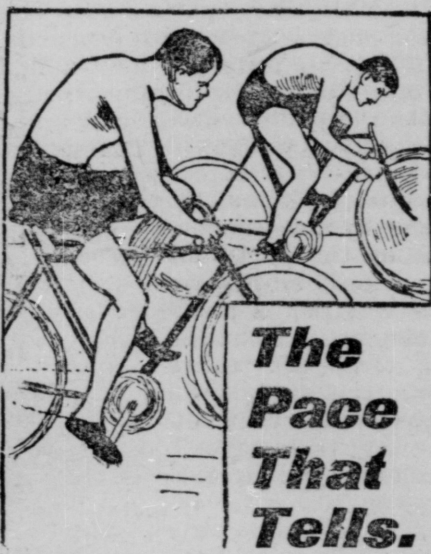
The Pace That Tells.

Thus was completed the destruction of Pompeii. If the estimate of fatalities above quoted be fairly correct, the loss of life was not more than one-third as great as during the recent hurricane at Galveston, whose terrors may be said to have fairly equalled those of this ancient catastrophe, though so different in kind. When it was all over, the roofs of many of the houses still emerged above the volcanic debris which had overwhelmed the city. Herculaneum, however, had wholly