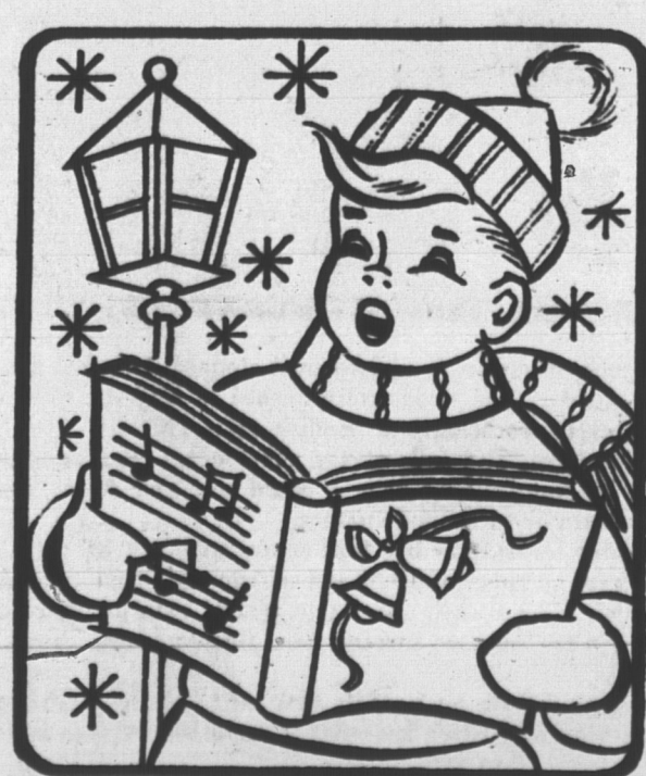
Here's a happy caroler to sing a Christmas song; color him and then we'll join in and sing along!