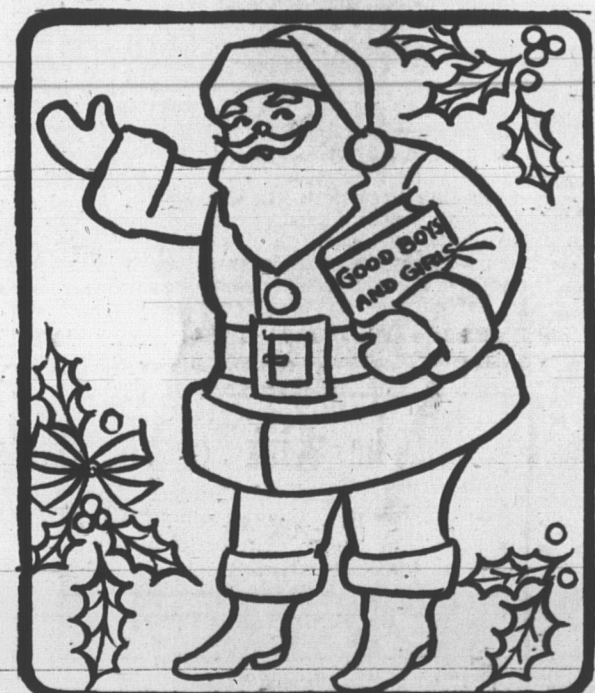
Color Santa's woolen suit a brilliant shade of red. When he comes on Christmas Eve, you'll be asleep in bed.