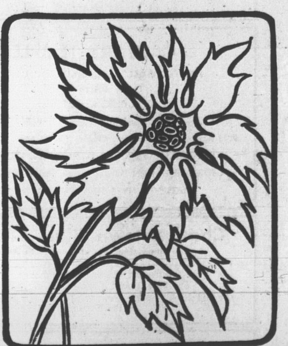
Color the bright poinsettia yellow and red and green. Isn't it the prettiest flower that you have ever seen?