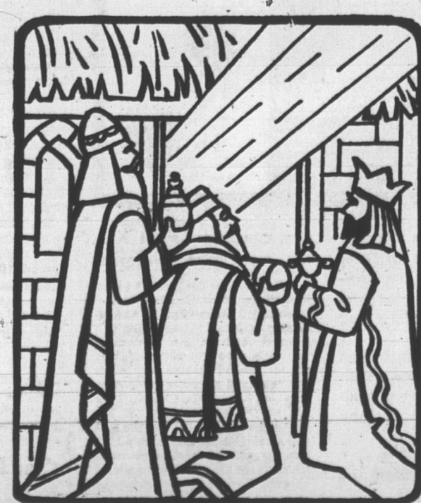
The Wise Men went to Bethlehem to see the newborn King; don't you wish you could have seen the Babe, the Star... 'n' everything?