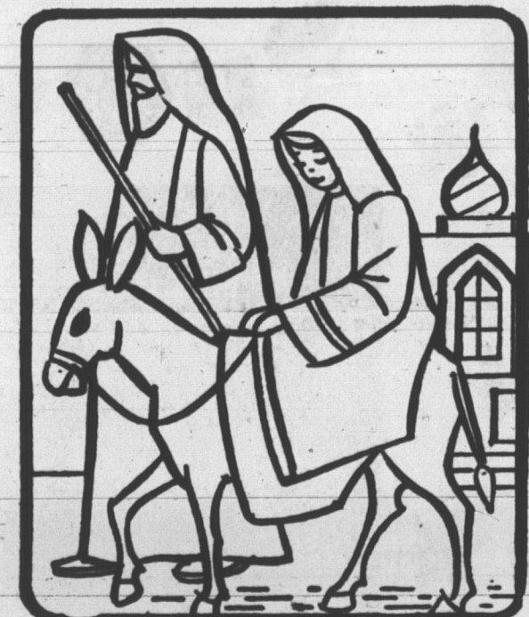
On the way to Bethlehem, Jesus' mother Mary rode upon a little donkey... it did not balk or tarry.