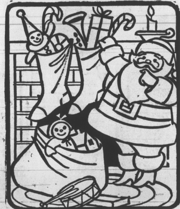
Hang your stockings on the mantel. Where Santa's sure to see. He'll fill them up with lots of goodies; how tasty they will be!