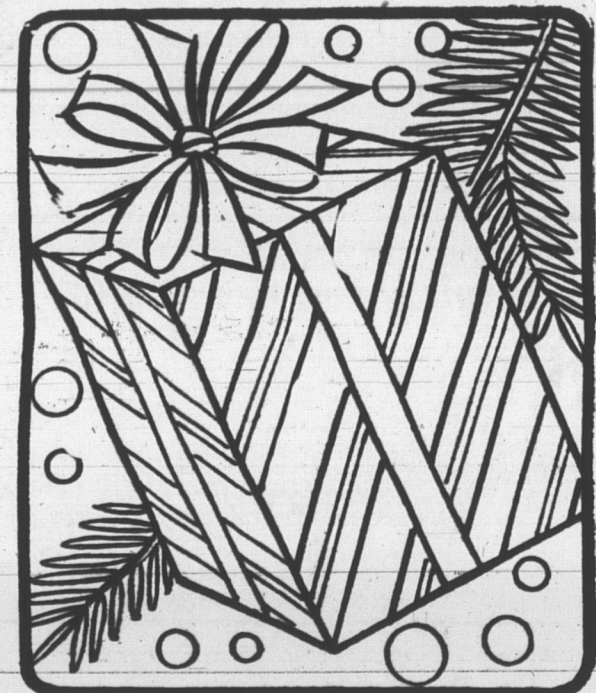
What a very pretty package this Christmas present makes. Color it with many crayons; see how long it takes!