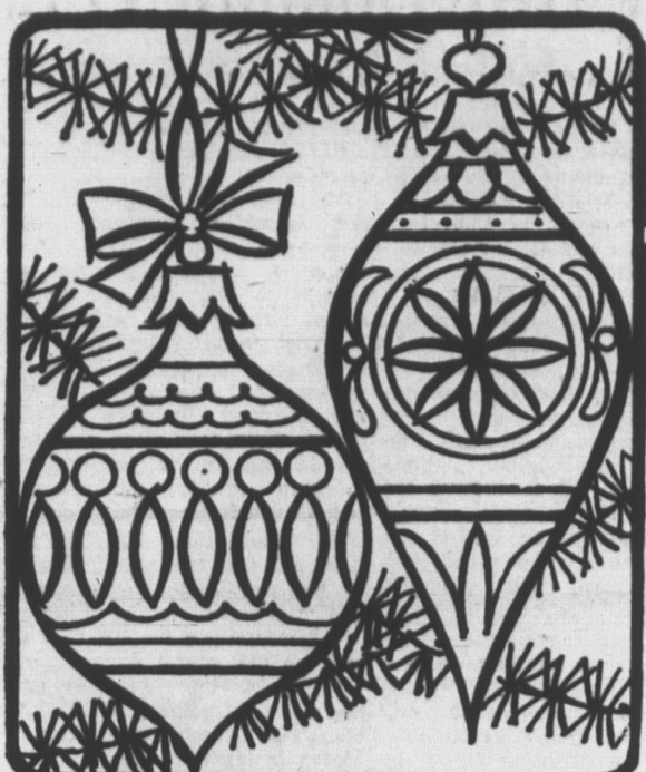
Oh, what lovely Christmas bulbs the tree is going to wear! If you'd like to color some, here's a handsome pair.