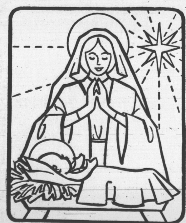
In a manger far away the Holy Babe was born; now we celebrate His birth every Christmas morn.