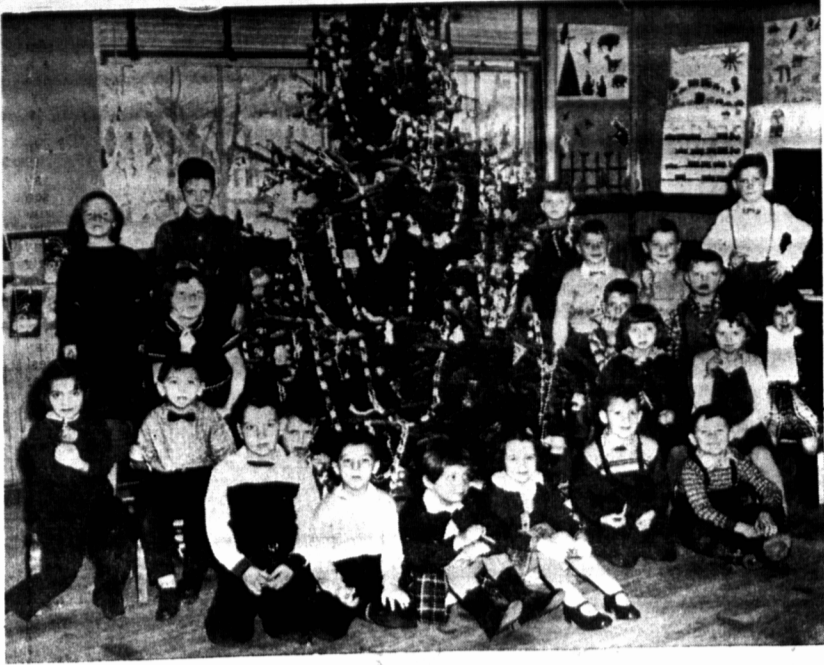
S'SIDE FIRST GRADES ENJOY PARTY