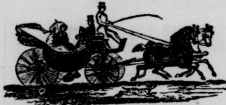
NORTH SIDE QUEEN SQUARE.

THE Subscriber, having purchased a number of New Sleighs and Furs, is prepared to hire Single and Double Teams, at shortest notice, during the winter.