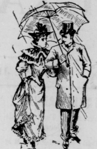
The flowers that bloom in the spring, tra la, Have nothing to do with the case; 'Tis the soft summer showers that spoil the fine gowns, Then the ladies give Rigby first place.