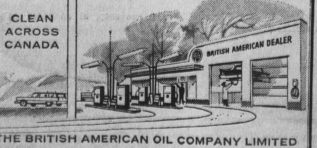
THE BRITISH AMERICAN OIL COMPANY LIMITED

IN EVERY B-A PRODUCT... THE PRICELESS BENEFIT OF QUALITY