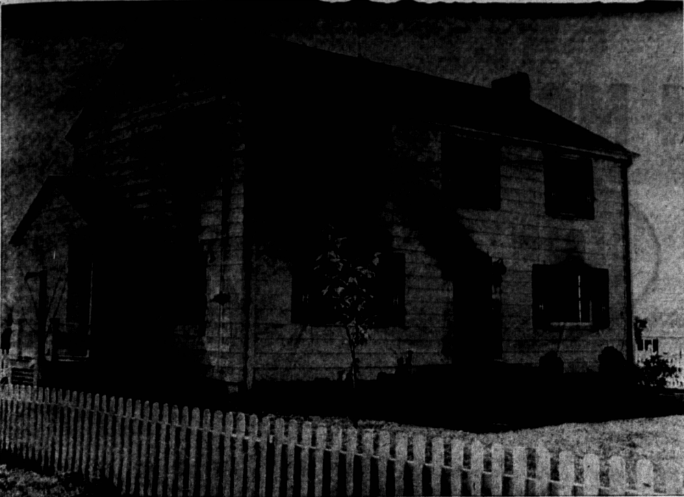
THE DAMAGED DWELLING