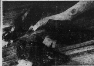
FOR LIGHTNESS AFOOT