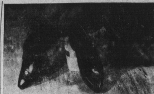
SLEEK AND SOPHISTICATED

The tight, fibrous structure of cowhide leather gives it the sturdy durability and unlimited flexing that today's homemaker or career girl takes for granted in her dress, walking and casual shoes. Yet that same bundle of fibres gives the leather its unique "breathing" action which allows fresh air to enter the shoe right through its sides. Only leather has this natural action, which explains why only in leather shoes do your feet feel dry, cool and comfortable.