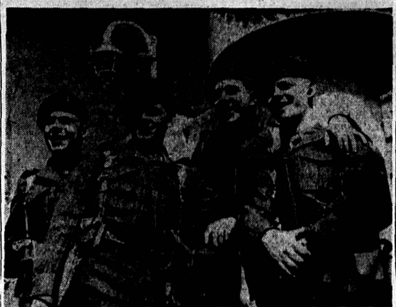
A group of 26 COTC personnel from Universities across Canada sailed recently from Montreal for Germany where they will spend a summer training period with the Canadian 27th Infantry Brigade.