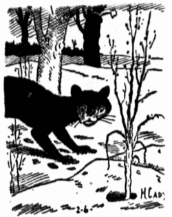
Black Pussy followed the Mouse smell as best he could.

The snow was quite deep over the ground. Jack Frost had formed a hard crust over it. It wasn't a very thick crust, but it was strong enough for Black Pussy to walk on without danger of breaking through. He decided to try a little hunting down on the Green Meadows, which were white instead of green now. He knew that many Mice live there all the year around. He had often hunted there in the summer and sometimes in the spring and fall. Once or twice he had been down in winter and he knew the Mice were still there.