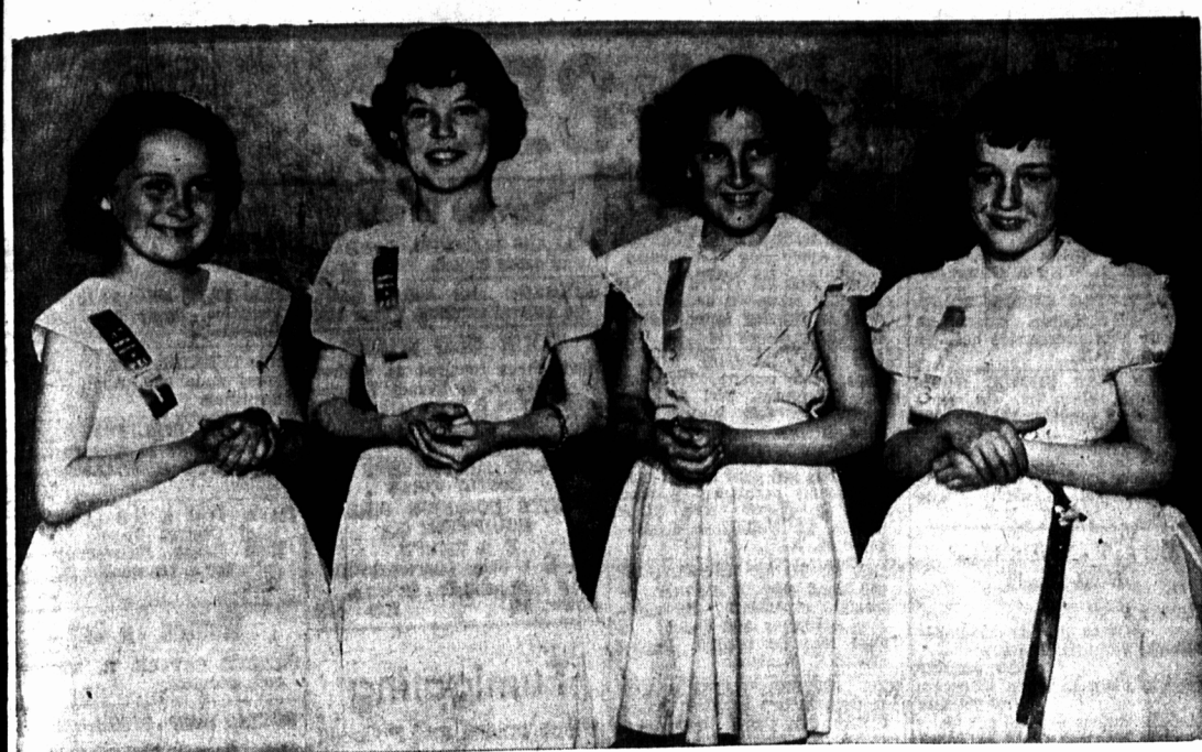
WINNERS FROM CLASS OF 41

"Farmers were hoping that the government has sufficient faith in its markets to continue those prices." HEAVY MOVEMENT Mr. Howe said there are "very heavy" movements of wheat through country elevators and to shipping ports and said he could assure Commons members that wheat exports in the current crop year ending July 31 will "substantially exceed" the 252,000,000 bushels exported last year. The wheat board, marketing agent for prairie grain producers, will close its books today on operations of its 1954-55 wheat pool and Mr. Howe said he expects to announce about mid-May the amount of the final payments for wheat in the pool. His statement indicated that the 369,867,000 bushels of wheat which remained in the pool at the start of the crop year have been whittled down to about 50,000,000 bushels. That amount will be transferred to the books of the current year's pool.