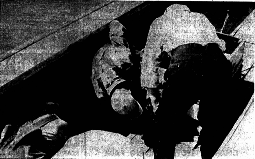
Pictured above are scenes at the boat races yesterday at Murray Harbor. In the upper pictures can be seen some of the boats competing along with visiting craft and the official float. Centre is a view of the spectators ashore. In the last picture three contestants tinker diligently with a motor prior to a race. They were too absorbed to notice a cameraman.