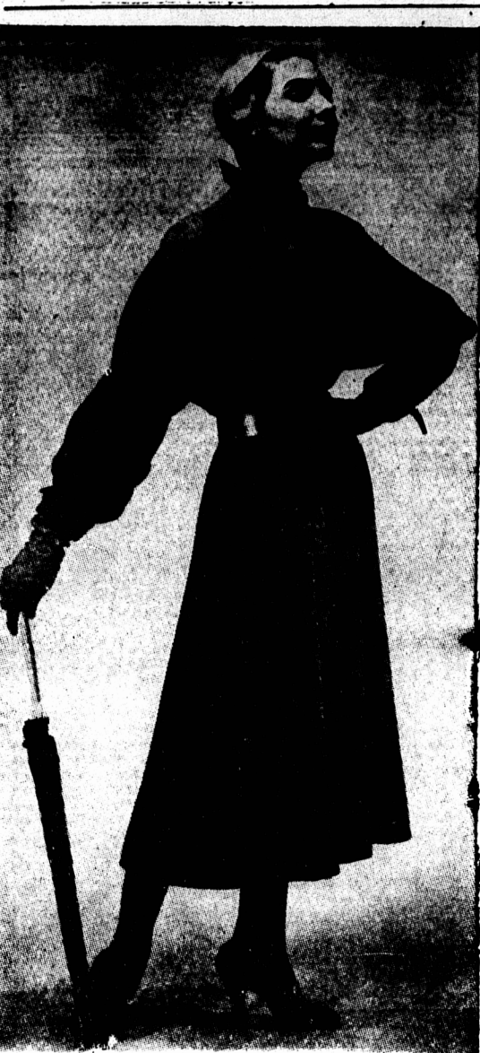
Beautifully detailed soft heather English tweed collarless coat with dolman sleeves. Flattering pleats fall from the diagonal pockets.

Q. Is it good taste, when dining in a restaurant, to wipe off the silver with a napkin? A. No, this is exceedingly ill-placed. If the silver is not clean enough, call the waiter and have him replace it.