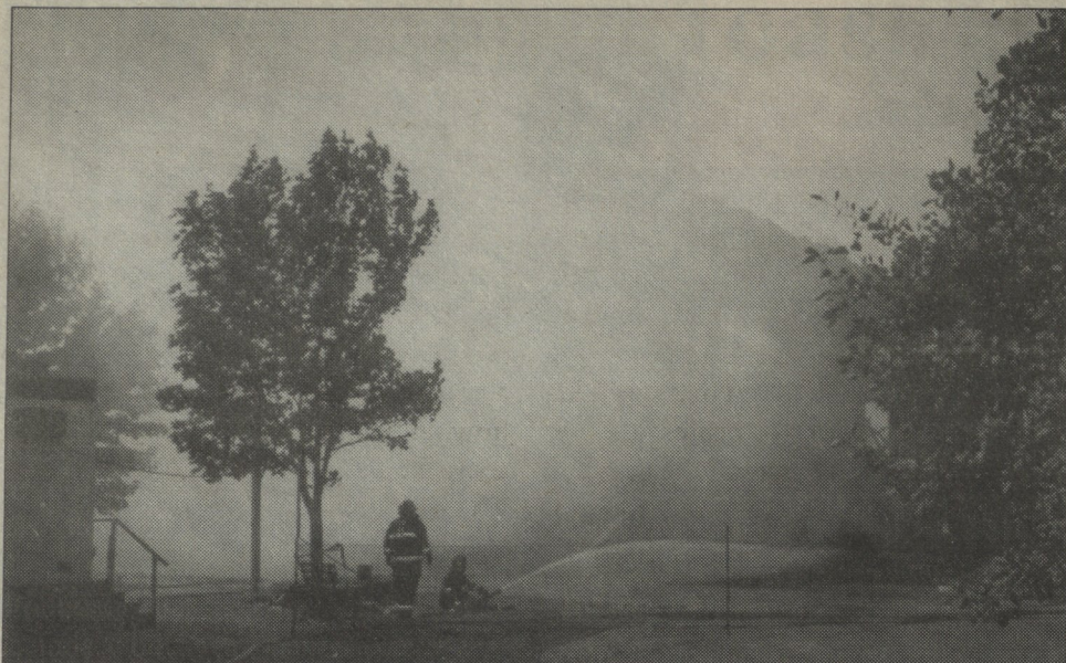
Hey, this reminds me of that Billy Joel Song... Piano Man.