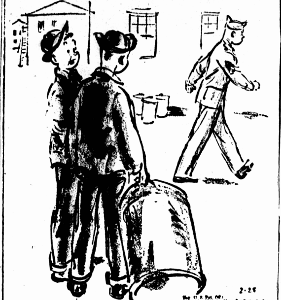
"I'll find this tough guy's soft spots. My old man was a sergeant."