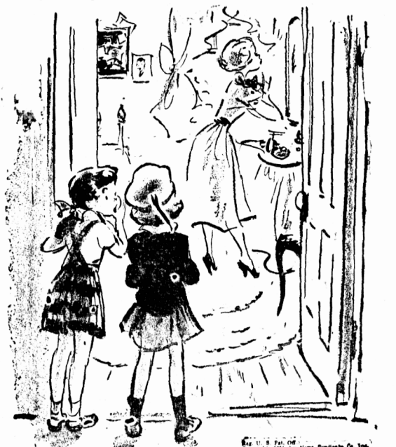
"It's a 'come as you are' party—she's been getting ready for two hours."