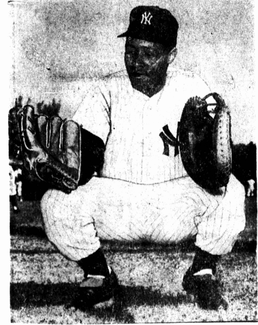
Elston Howard of the New York Yankees contemplates a fielder's glove and a catcher's mitt at the Yanks' St. Petersburg, Fla., training camp. He wonders where he'll wind up in the American League champions' lineup the outfield or behind the plate. Howard, a star with Toronto Maple Leafs a few years ago, is adept at both positions.

NEW YORK (AP)—Johnny Podres, the young miner's son who pitched the Brooklyn Dodgers to their first world series championship last fall, became just another of Uncle Sam's sailor boys Monday. Once declared unfit because of a back ailment, the 23-year-old lefthander passed his induction physical examination at New York's armed services building and immediately was assigned to the Bainbridge, Md., naval center for basic training. Johnny, in fine spirits, said he would spend the night at the barracks at Brooklyn navy yard and probably report to Bainbridge today. "I've got to spend my time in service the same as anybody else," the stocky, blond youth from Witherbee, N.Y., said.