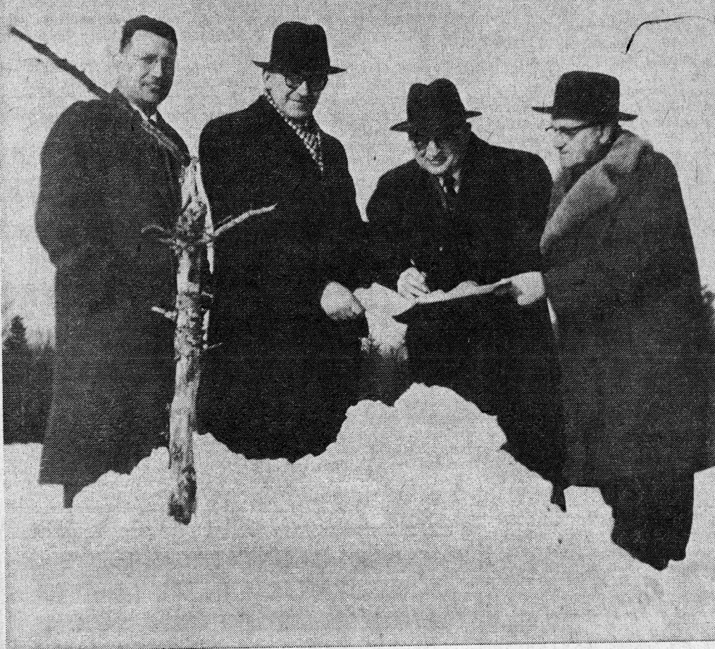
THE STICK MARKS THE SITE